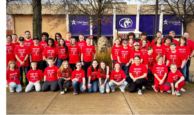
2023 South's BEST Finals at University of North Alabama

4. Engagement Opportunities: Finally, being a sponsor gives your organization additional opportunities for engaging with your future workforce. We love to have sponsors come see what we do and we love to visit with our supporters to share how your support has made an impact.