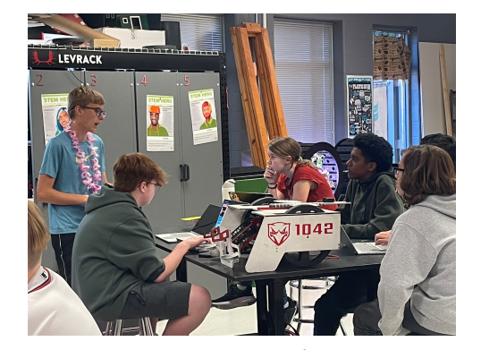
Programmers helping students from another team

Beyond hosting and participating in these kinds of events, we also mentor other new robotic teams in our community by sharing best practices, providing workshops, and having an "open door" policy to allow any of their team members a place to learn.